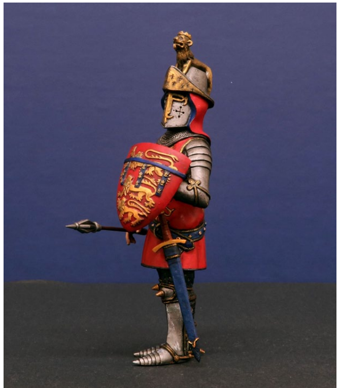
David Zucker's 120mm 14th Century English knight, painted with Citadel metallics and various acrylics.